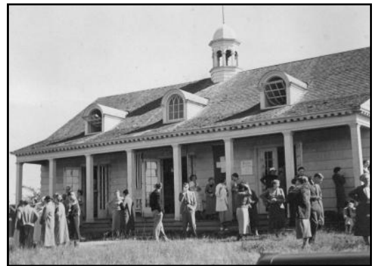
Participants during a break at Jung’s 1936 seminars.

Sunday, Sept. 25, 9:30 AM – 3:30 PM Bailey Island Library, Maine 2167 Harpswell Islands Rd., Harpswell Members, *$85; Non-members, *$95 * Register & pay by Friday, Sept. 16, & receive $10 off fee. This program is full with a short waitlist!