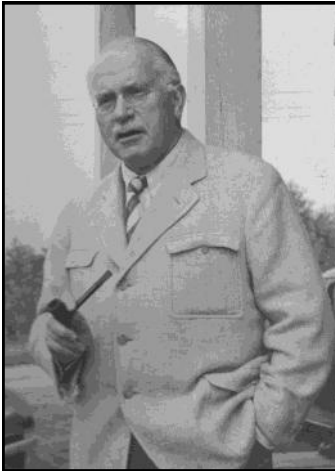
Jung at Bailey Island, 1936

183 Park Row, Brunswick, ME 04011 • (207) 729-0300 • info@mainejungcenter.org • www.mainejungcenter.org