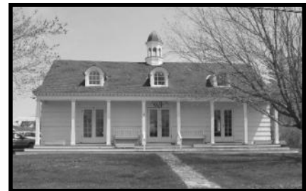
Bailey Island Library Hall Harpswell, ME