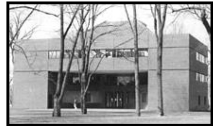
Visual Arts Center at Bowdoin Beam Classroom